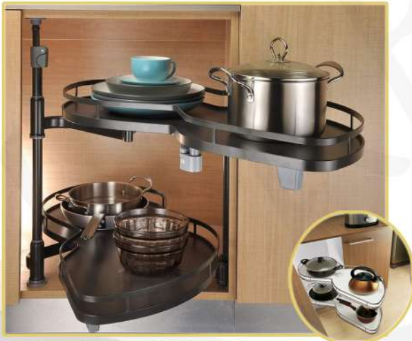
Swing Corner With Rail