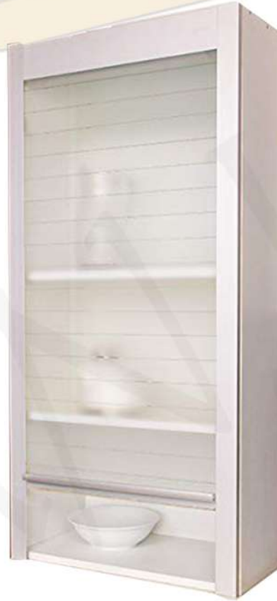
Glass Rolling Shutter Frosted