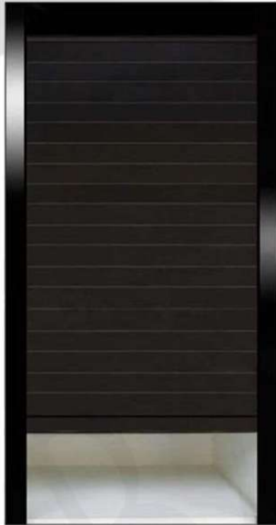
Glass Rolling Shutter Black