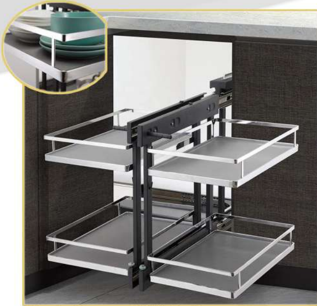
Magic Corner With Rail

These corner storage systems have baskets which rotate independently . So you can store difference types of items separately and ensure that they never get mixed up. The contents can be displayed neatly and are easy to see the access.