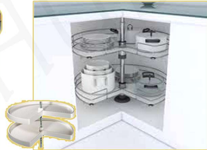
Carousel Circular Tray