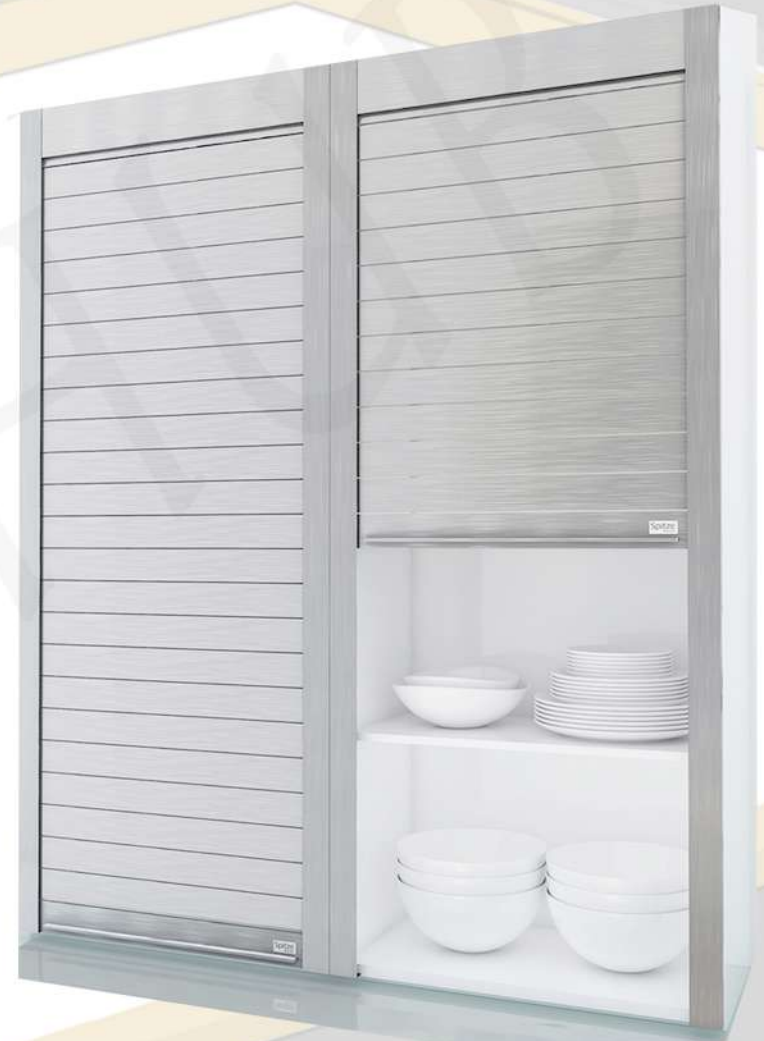
Glass Rolling Shutter Aluminium

Roller Shutters are highly efficient door systems which can be used in numerous applications both horizontally and vertically.