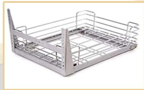
GRAIN BASKET (HEAVY WEIGHT)