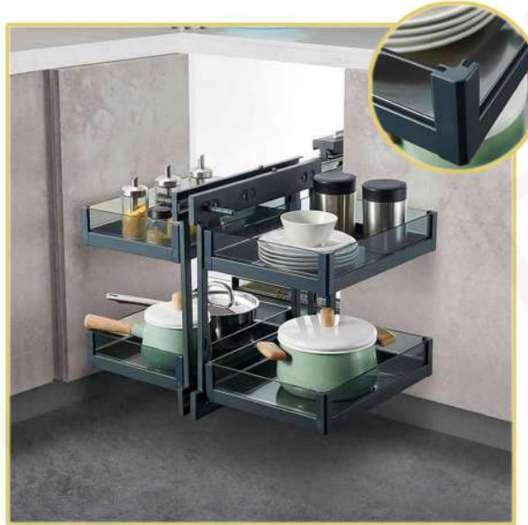
Magic Corner With Glass Rail