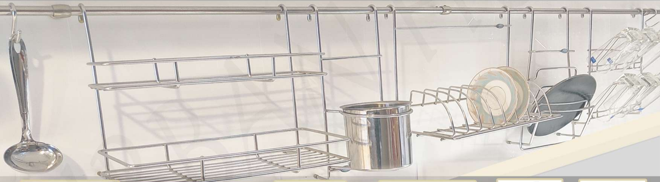
Wine Glass And Cup Hanger