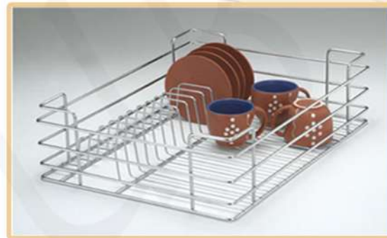
CUP AND SAUCER