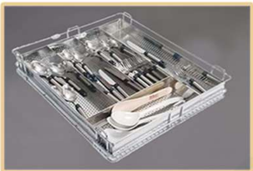
PERFORATEED CUTLERY BASKET