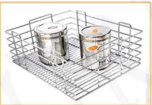
PLAIN BASKET (HEAVY WEIGHT)