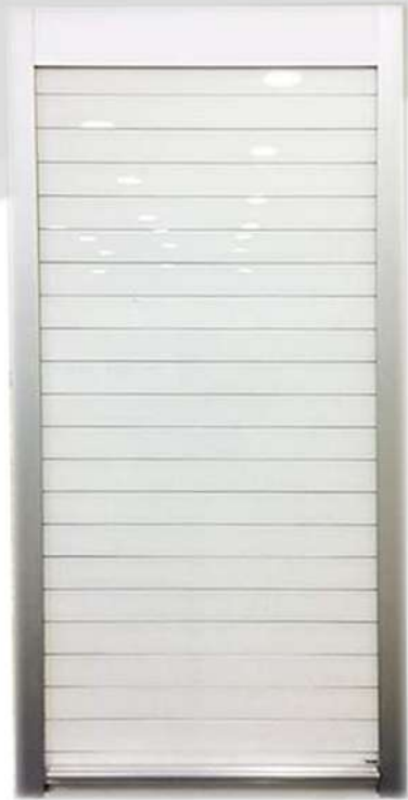
PVC Rolling Shutter White